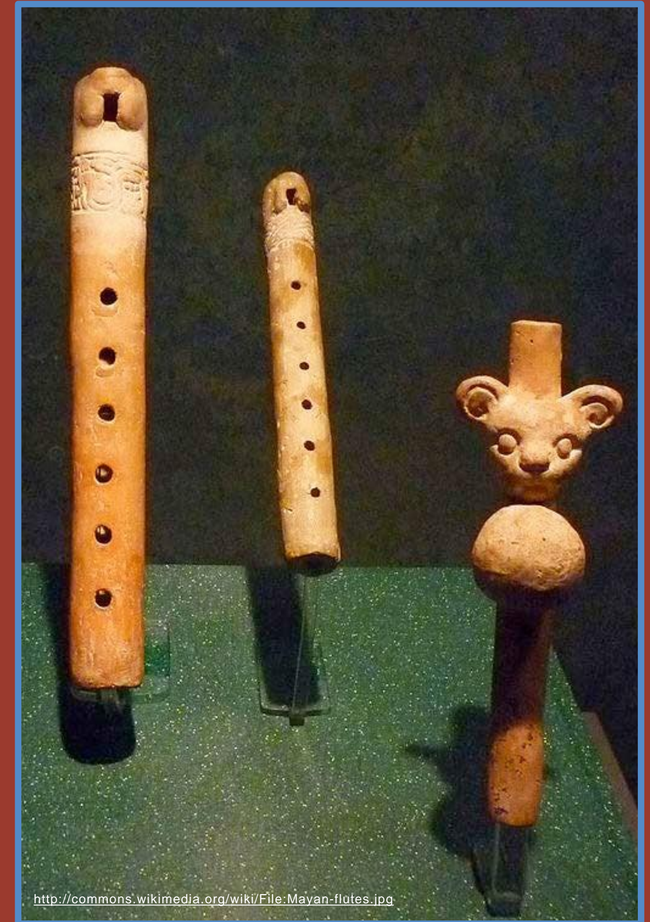
These are Mayan flutes.