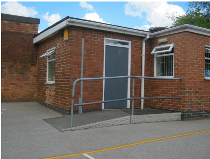
ICT suite entrance