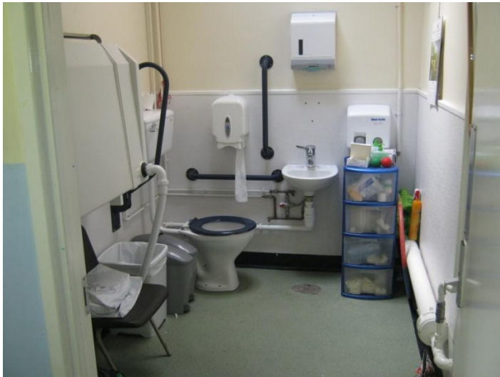
Accessible toilet – main building