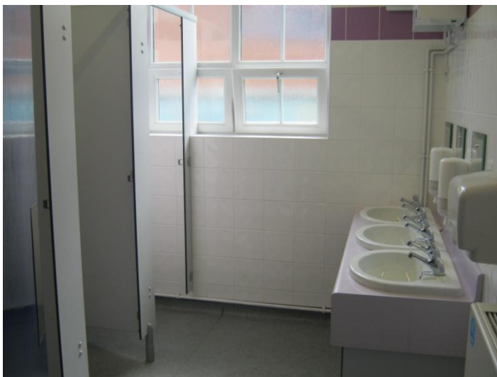
Children's toilets – main building