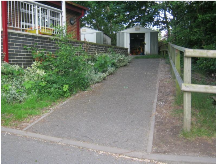
Access to RHS of top building