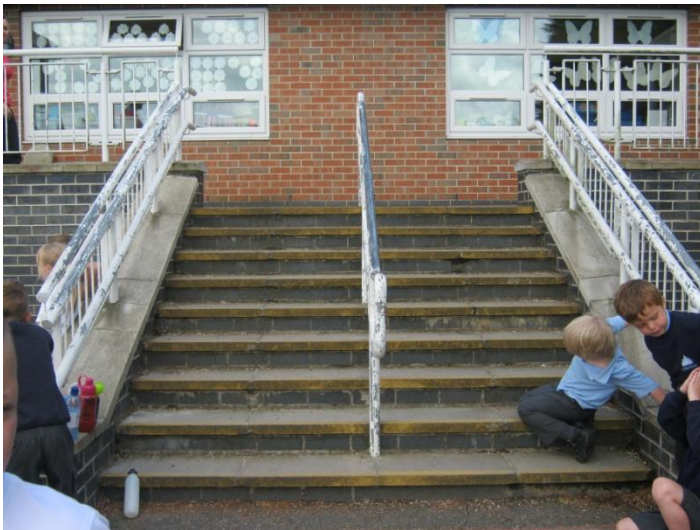
Steps from playground to classrooms