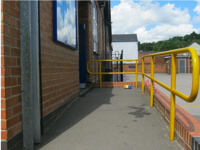
Access from main building to playground