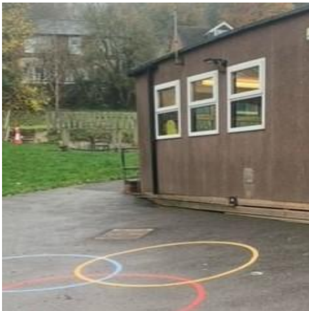
Pathway to LHS of terrapins