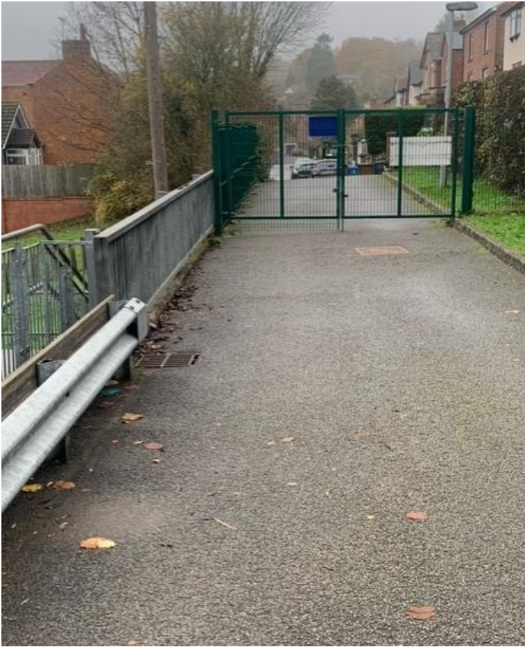
Top level – rear entrance