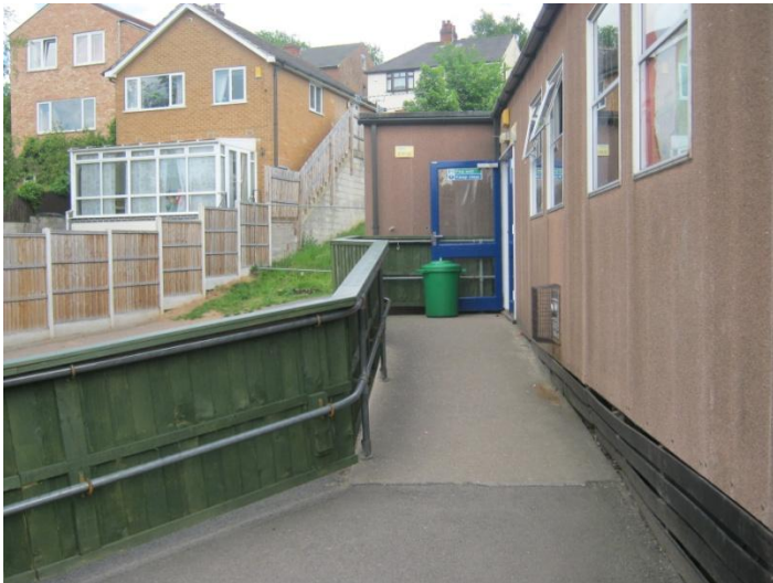
Terrapin classroom entrance